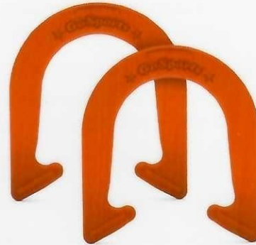
(2) Red Steel Horseshoes