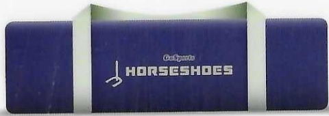
(1) Carrying Case